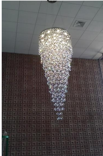
New Lobby Chandelier

Presently, (Oct. 08 th , 2013) we have all the electrical plans approved by the City of Miami Beach to proceed with the installation of the pool lighting in all the pool area, we will have all the bidding complete no later than October 15 th .